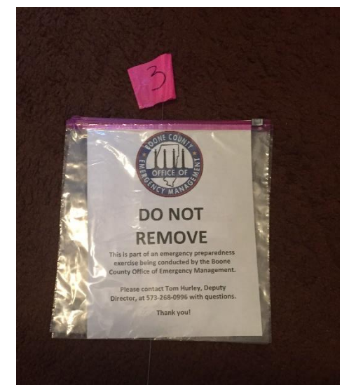
Figure 2 OEM's Drop Point #3 packet

We covered all 29 locations in our 650 Square mile county with 2 repeaters in 2 hours with little to no problems. One problem developed at the ECC when the 146.76 MHz station significantly interfered with the station operating simplex, 146.505 MHz. So, whereas the exercise began on the 146.76 repeater with a role call